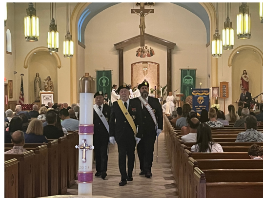
Honor Guard on duty!