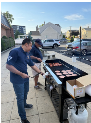
Beyond Baptism BBQ at OLMC