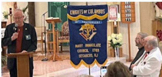
PGK Rich Steffens welcomes the audience to the ceremony.